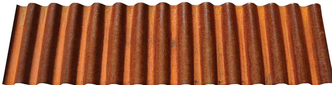
Shown in A606-4 (aka Corten®)

***Material does not arrive pre-rusted. Panel will rust naturally with exposure to the weather. Use stainless steel screws with a painted brown screw head for installing the panels.