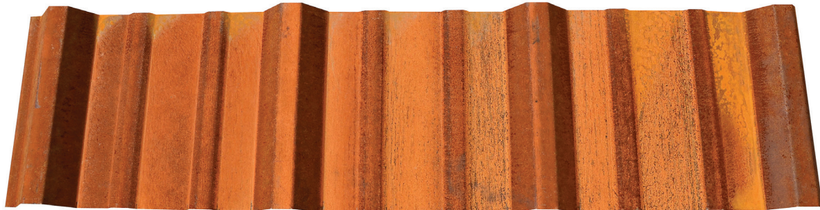
Shown in A606-4 (aka Corten®)

***Material does not arrive pre-rusted. Panel will rust naturally with exposure to the weather. Use stainless steel screws with a painted brown screw head for installing the panels.